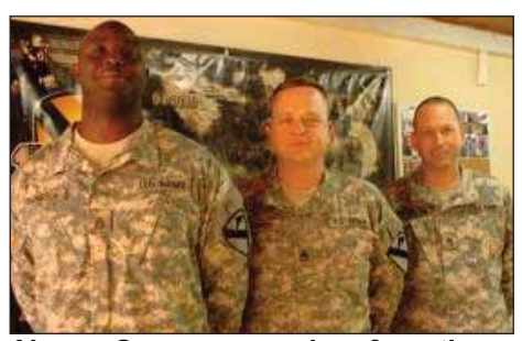
Above: Career counselors from the 15th Sustainment Brigade work to keep troops in boots.

contracting can take full advantage of education benefits and possible active guard/reserve technician jobs at their hometowns.