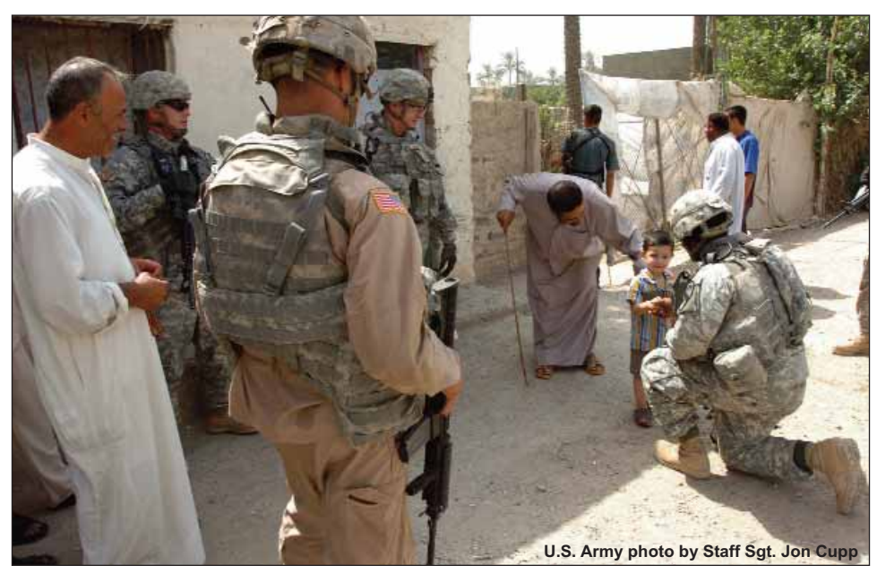
barriers. They also played with the children, Soldiers from Troop D, 1st Battalion, 82nd Field Artillery Regiment, greet local villagers in Falahat, kicking soccer balls to them. When the paint- Iraq July 7 during a "fun day" for the village's children sponsored by Trp. D.