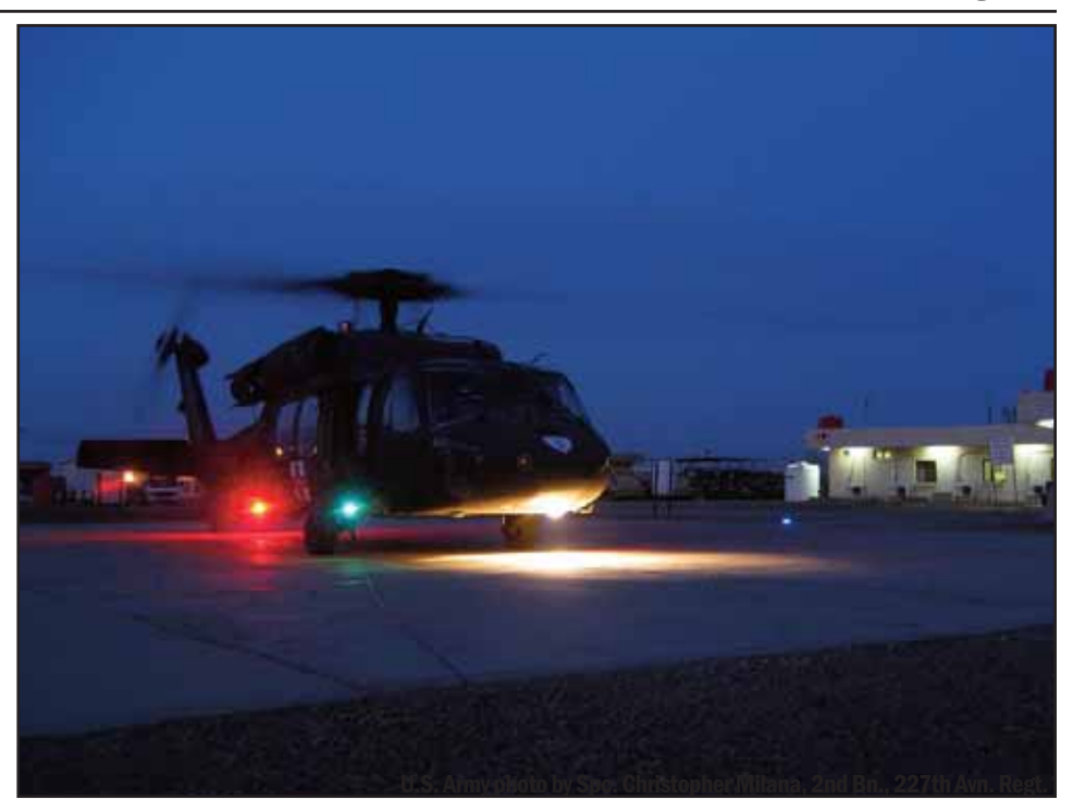
A UH-60 Black Hawk medical evacuation helicopter from Company C, 2nd "Lobo" Battalion, 227th Aviation Regiment, 1st Air Cavalry Brigade, 1st Cavalry Division, gets ready to head out on a mission at Camp Taji, Iraq. The MEDEVAC crews are known for their ability to be off the ground in less than ten minutes after receiving a call for their assistance.

The medics are the ones who basis," he said. are affected the most because