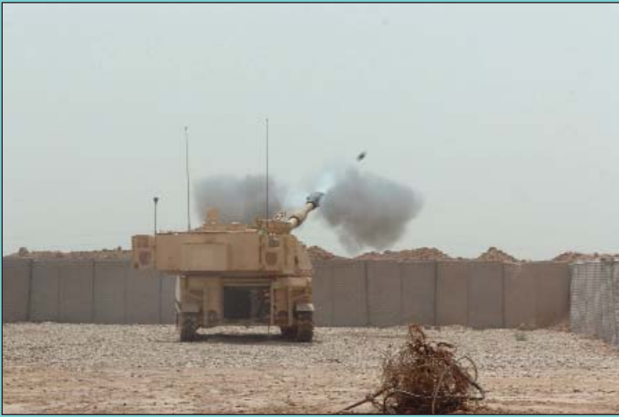
Soldiers from Battery B, 1st Battalion, 82nd Field Artillery Regiment fire a projectile which flies from the barrel of an M109A6 Paladin howitzer on Camp Taji, Iraq June 2. The troops performed the calibration fire to pinpoint and test the accuracy of rounds fired from the howitzer.