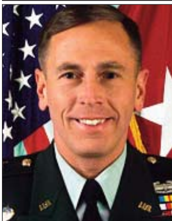
Gen. David H. Petraeus Commanding General Multi-National Force - Iraq