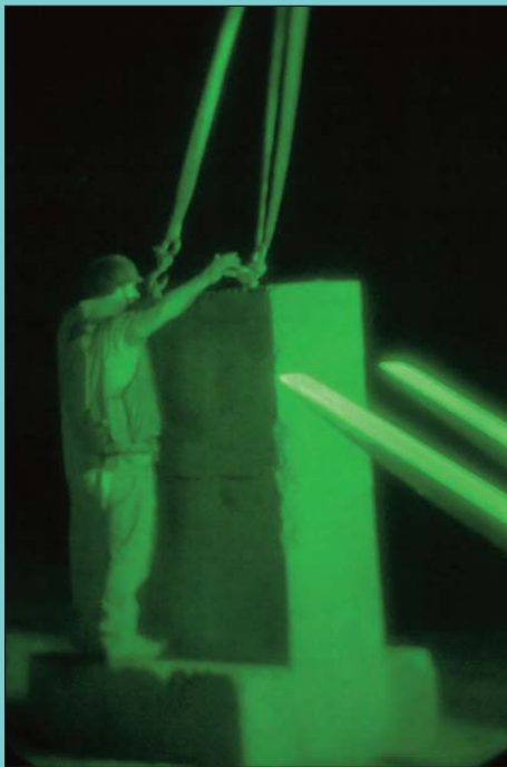
Above: Kellogg Brown and Root personnel hook a crane to an Alaska barrier so it can lift the heavy cement and maneuver it into place at a traffic control point (TCP) June 8.