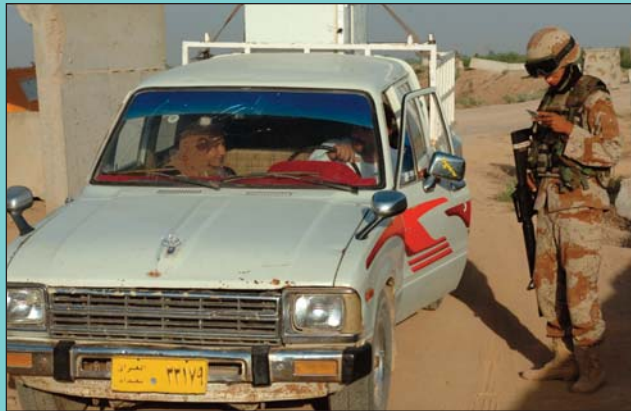
Left: An Iraqi Army Soldier with 3rd Brigade 9th Division checks the identification card of a local passing through a traffic control point, June 18. Below: Soldiers from Annihilator Company 2nd Battalion 8th Cavalry Regiment work along side Iraqi Army Soldiers from 3rd Brigade 9th Division at a traffic control point.