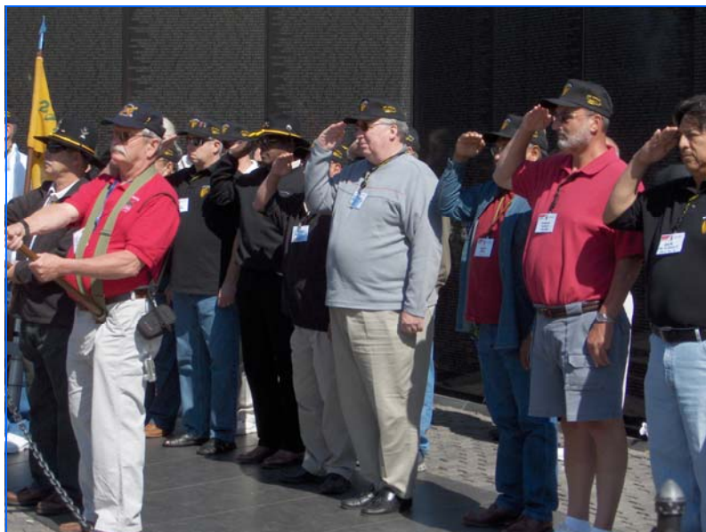
During the ceremony at the wall while the Army Bugler played Taps.