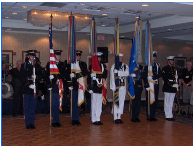
At the opening of our program at the banquet Saturday evening, Color Guards were provided by the Joint Services of the Military District of Washington. The band played a version of Taps written by the band of Maynard Ferguson.