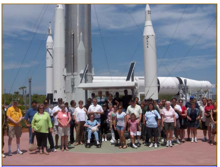
Group Photograph at the Kennedy Space Center Tour