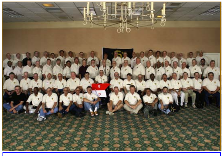
ASA, Inc. 2006 Group Photograph - Orlando, Florida